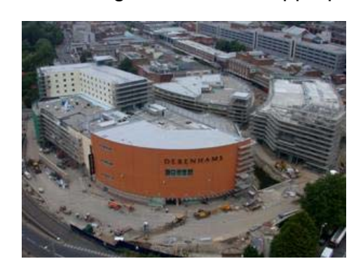
degree of control over uses within individual parades. [Question 29]

safeguarded. Consideration therefore needs to be given as to the appropriate