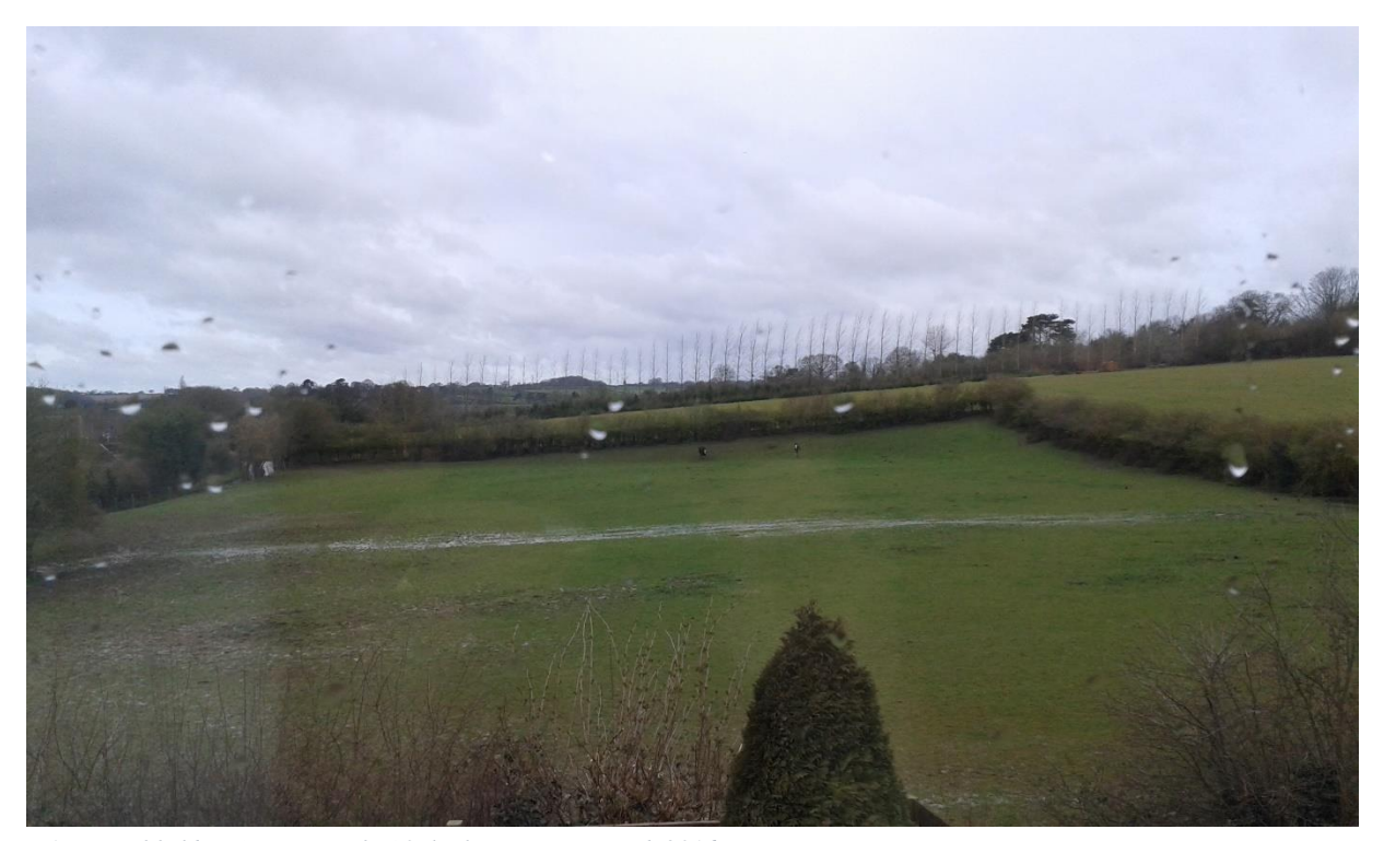
Figure 1 View of field in SE corner of LA3, looking west – March 2016

Link to Video on WHAG facebook page, showing flooding along Chaulden Lane – March 2016: