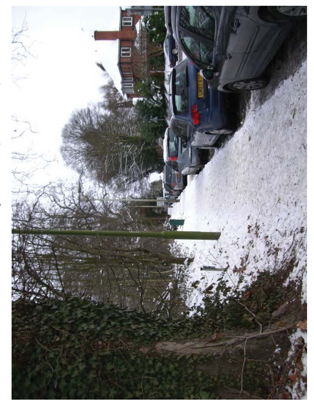
Berkhamsted Residents' Action Group Submissions to Independent Examination